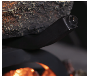
HIDDEN MANUAL ON/OFF BUTTON