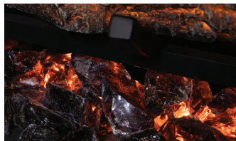
REALISTIC EMBER BED WITH GLASS